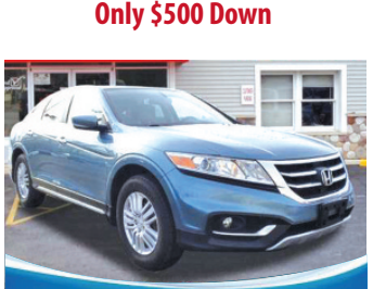
2013 HONDA CROSSTOUR EX STK #699 As Low As $249 /mo.

2003 FORD F-150 XL SUPERCAB 4WD STK #644