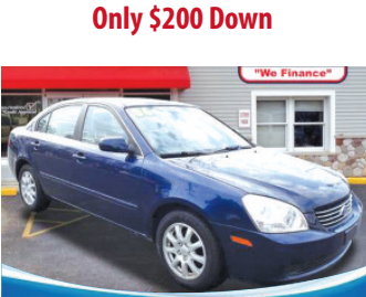
2006 KIA OPTIMA LX STK #530