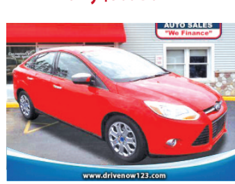
2012 FORD FOCUS SE STK #561 As Low As $199 /mo.